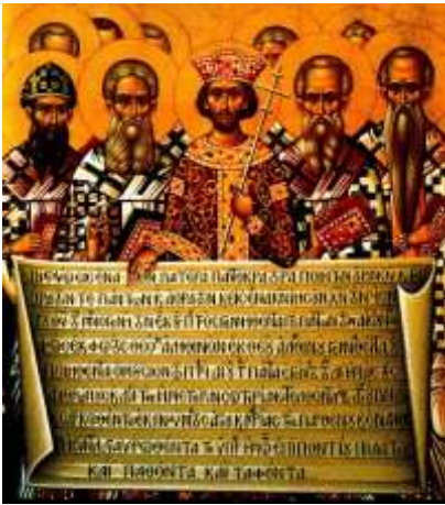
Early depiction of the Council of Nicaea; Constantine at the centre.

Some of the most distinguished literature in church history was produced between 325 and 451. Notable writers of this period included the historian Eusebius, the bishop Saint Athanasius, the theologian Saint Augustine, the preacher Saint John Chrysostom, the poets Saint Ephrem and Prudentius, and the Biblical scholar Saint Jerome. The writings of these men had a great influence on church thought in later centuries.